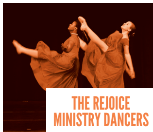
THE REJOICE MINISTRY DANCERS